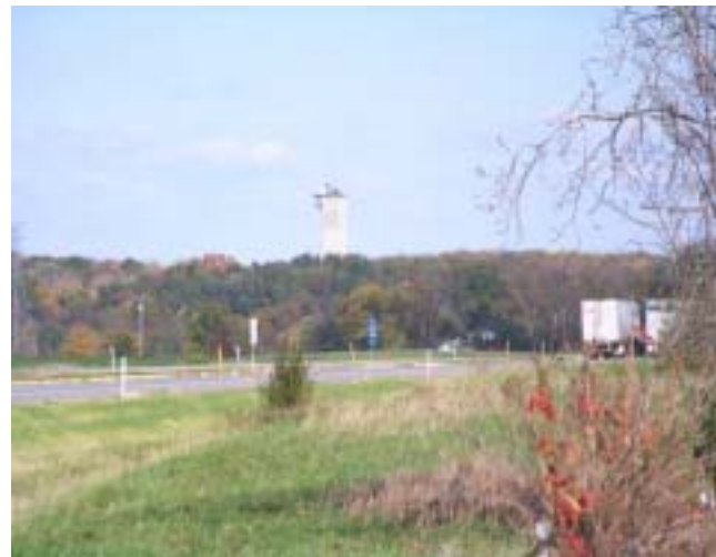
A Photo of the tower

If you have not signed up yet, it is easy. Visit http://w9ly.org/yabb and register. Just another service from MRCARC.