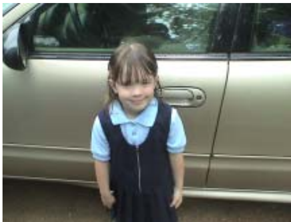
1st day at school